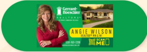
Gerrard Hoeschler Realtors