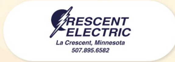
Crescent Electric, Inc.