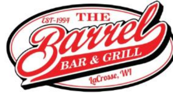
Barrel Inn Bar & Grill